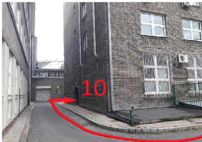
Electrical-Technology Building entrance "C"